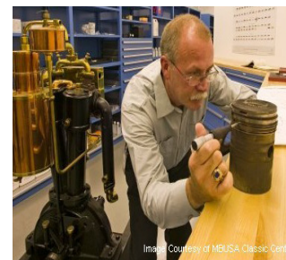
Restoration: Parts for Your Classic Mercedes-Benz Tom Hanson, MBUSA Classic Center