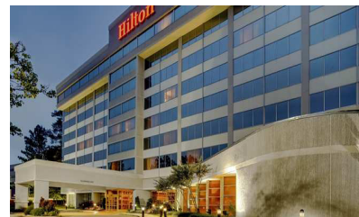
Hilton Birmingham Perimeter Park Hotel