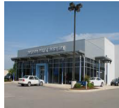
Mercedes-Benz of Huntsville