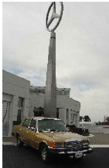
MBUSI Visitors Center & Museum