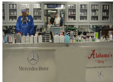
Classic Car Motoring