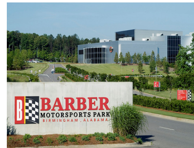
Barber Vintage Motorsports Museum