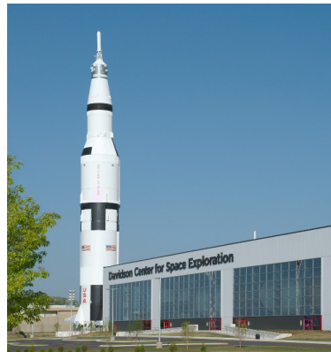
NASA Rocket Center